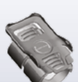
• Wearable Holder