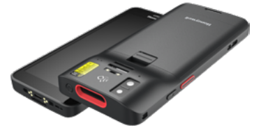
The CT37: 5G mobile computer on the Mobility Edge™ platform, elegant, slim, powerful, durable, and easy to use.

The CT37 also comes with the latest 5G and Wi-Fi 6E technology to stay connected in both indoor and outdoor environments. 5G offers the highest bandwidth and lowest latency available for frontline workers. Whether you are on a private 5G or CBRS network, or a Wi-Fi 6E environment, your networks can continue their workflows with reliable uptime.