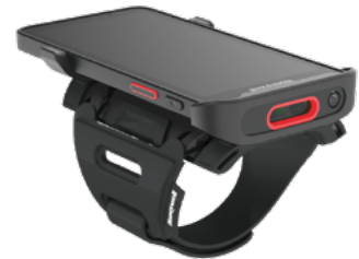
The CT37 Wearable solution for a hand-free

The CT37 is armed with the latest FlexRange FR bright green dot laser, which is more visible at long distance and under strong sunlight than devices configured with red dot laser. It brings long range scanning performance found in industrial devices to lightweight, pocketable devices like the CT37. The ultimate in flexibility, FlexRange enables virtually every scanning use case in a single, compact device without compromising range or speed, enabling businesses to focus on fewer device types to manage.