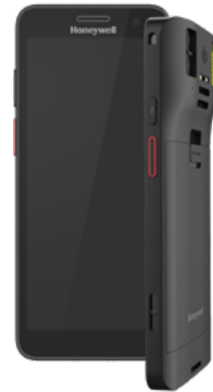
The CT37: 5G mobile computer on the Mobility Edge™ platform, elegant, slim, powerful, durable, and easy to use.

Reliable performance, data connectivity, and communications for frontline mobile workers, the CT37 is an all-purpose hand-held device tool to keep business workflows moving and operations flowing. Combined with powerful software including Operational Intelligence, Smart Talk communications, Smart Pay, and more, the CT37 is the ideal platform on which users in retail, healthcare and delivery can build effective solutions.